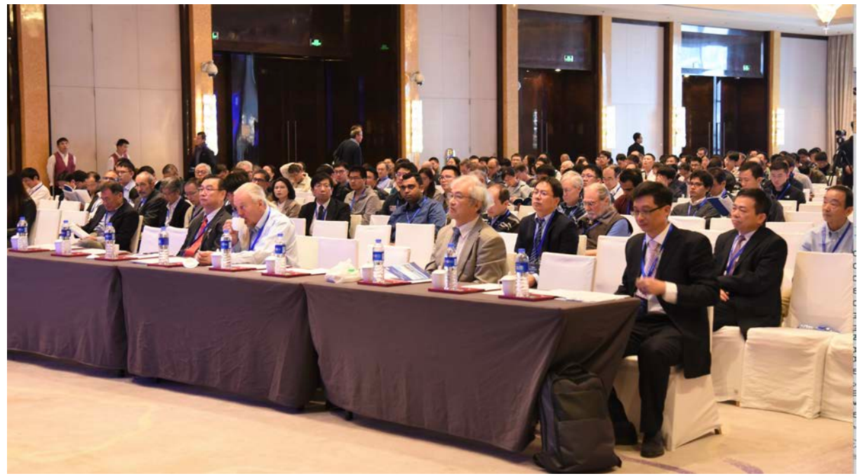
Floor view of participants in AAPPS-DPP2019 in Crown Plaza Hotel